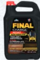
FNAB53 1 Gallon 50/50 Bottle Gallon UPC: 074804-03358-8 Case UPC: 074804-13349-3 Case SCC 14: 1-0074804-13358-5