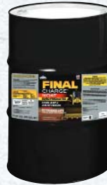
FNAB51 55 Gallon 50/50 Drum 0-74804-05377-7