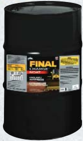
FNAOB1 55 Gallon Concentrate Drum 0-74804-05376-0