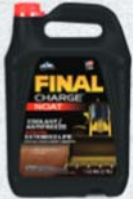
FNAOB3 1 Gallon Concentrate Bottle Gallon UPC: 074804-03349-6 Case UPC: 074804-13349-3 Case SCC 14: 1-0074804-03349-3